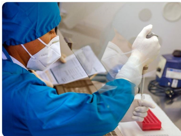
Through PEPFAR, the U.S. has invested in surveillance systems, laboratories, supply chains, & health workers around the world.

For further reading see: N Engl J Med 2023; 389:1159-1161 https://www.nejm.org/doi/full/10.1056/NEJMp2310330